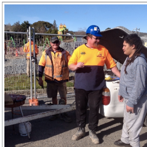
Te Kauri checking out the new developments at Avalon Park - just down the road from school!