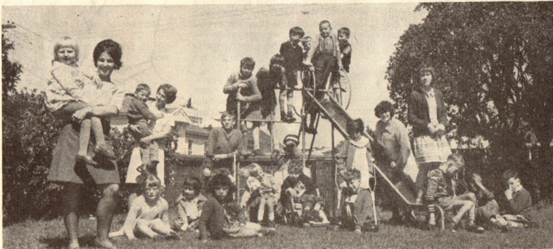
Pupils of the Kimi Ora Cerebral Palsy School pictured in the grounds of the school. Two of the staff (at left) are holding some of the younger pupils.

BALM makes these awards to promote safe working, but the possibility of thereby helping the handicapped, the poor, or the elderly in the community gives satisfaction to all in the Company. It gives the safety achievement an extra purpose.