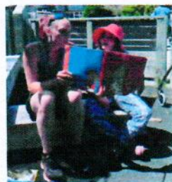
Some of the exciting happenings so far this term!