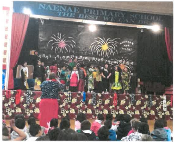
Some students went to celebrate Samoan Language Week at Naenae Primary's Samoan Festival.