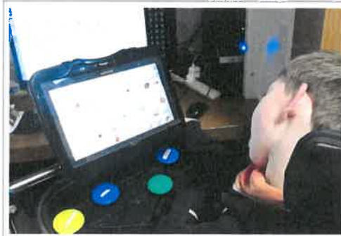
Zaxton writing a story.