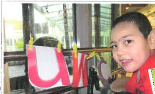
Guen on a letter hunt.