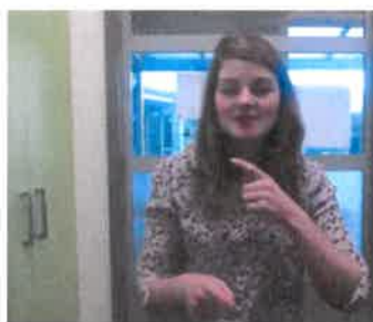
Tere - Fast!

Of course, you can also increase your Te Reo through StoryPark - thanks to Brynlea who has been putting up weekly movies of the sign of the week in both Maori and English.