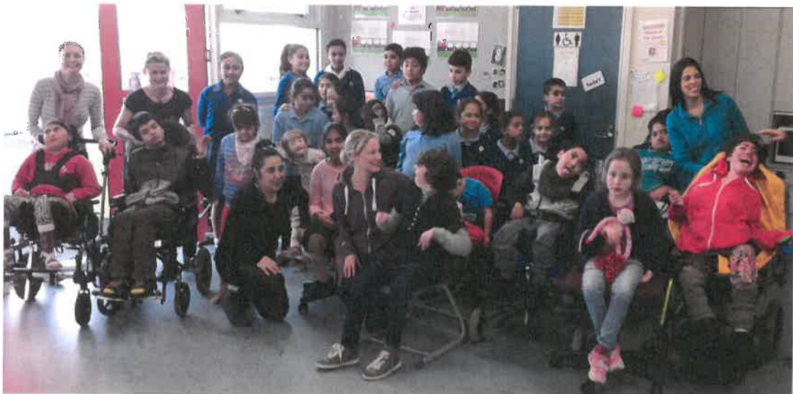
Chilling with St Patrick's Primary after the awesome disco fun!

He aha te mea nui o te ao? He tangata! He tangata! He tangata!