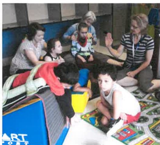
Kea Class during their morning welcome session.

During the holidays staff have worked hard to develop an exciting programme for the term. The topic of learning is "What's Cool Around Our School?" We will be learning about different places and people around Wellington and Lower Hutt. During weeks four and six the whole school will take part in Education Outside the Classroom (EOTC) days. This will include activities such as visiting Aotea Lagoon, Wilton-Otari Bush, fishing,